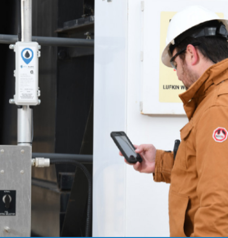
Figure 3. The WellAware system improves workforce efficiency with mobile tools.