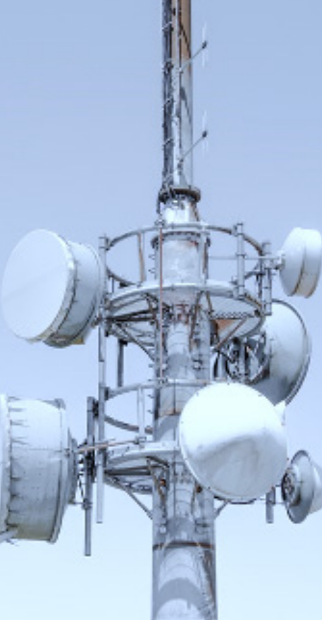
Figure 2. The RF solution proposed by an engineering consulting firm was not economical.